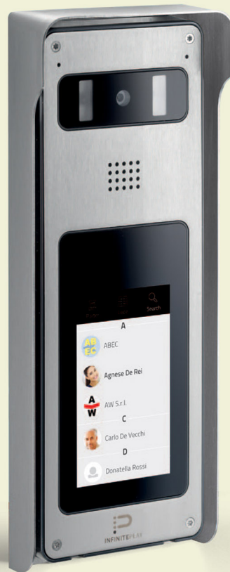
Z100D / Z100P Stainless Steel

The front cover is in AISI 316 Scotch Brite brushed stainless steel.